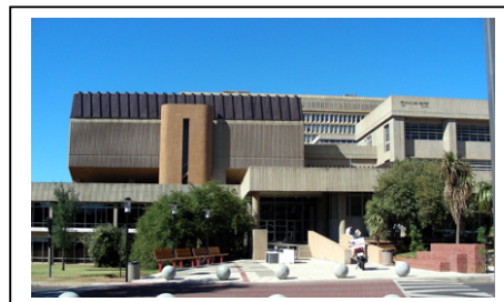
Retief Building, Universitas Hospital Bloemfontein